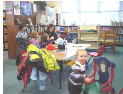
Some of the libraries youngest patrons, thrilled to come back to "their library".

A lot of hard work and muscle went into fixing the library and making the changes that we are proud to be able to present to the public. Everyone from the contractors (the carpenters, the glass repairman, and electrician) to staff and volunteers has worked hard and poured their heart into this project. It's been a long 2 months, but worth the time spent making the much needed improvements. A new front door, new rugs and a freshly stained front desk warmly welcome patrons into the library. A new children's circulation desk and media area, a more welcoming reading area, new media shelving in the adult section, rearranged shelving and other changes also are in store for the public.